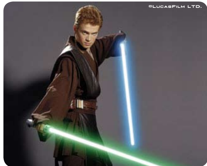
ANAKIN SKYWALKER - JEDI PADAWAN

These negative feelings were amplified when Anakin was reunited with Senator Padmé Amidala. Anakin and Obi-Wan were assigned, at Chancellor Palpatine's request, to protect Padmé Amidala in the wake of an assassination attempt. Anakin and his master quickly foiled a second attempt, though would-be assassin Zam Wessel was silenced before she could be interrogated. The council decided to assign Anakin to Senator Amidala full-time on her homeworld of Naboo as his master followed a lead on the armored figure that silenced Wessel.