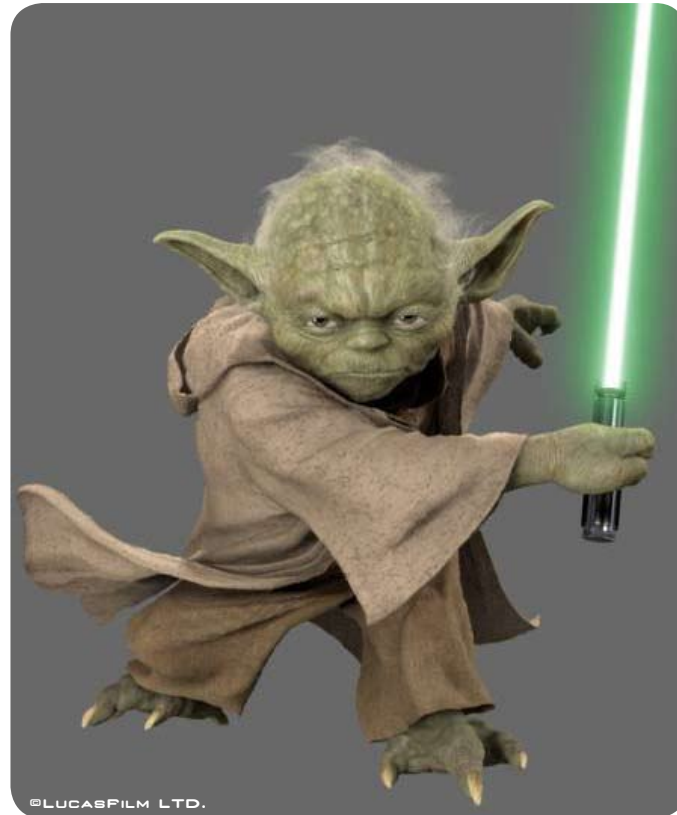
JEDI MASTER YODA

and the three clone troopers made a stand against the enemy droids. The enigmatic Jedi Master faced off against a line of Trade Federation tanks and several squads of battle droids in a staggering display of combat prowess as his troops supported him from a distance. Impressed by Yoda's skill, Katuunko rejected the Confederacy's offer and Ventress tried to assassinate him for his choice, but Yoda intervened. Handily outmatched by Master Yoda, Ventress fled. Without discussion, Katuunko granted Yoda's bravery and skill with an agreement to allow the Republic to install a base on Toydaria, at the edges of Hutt Space.