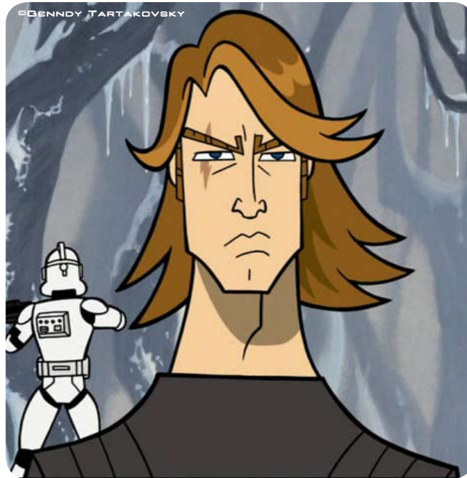
SKYWALKER AND HIS MEN ON NELVAAN

mechanically engineered organism similar to Umgullian racing blobs. The creatures fought with hive-mind intelligence and the two Jedi were barely able to escape with their lives before the facility collapsed from the damage it had sustained.