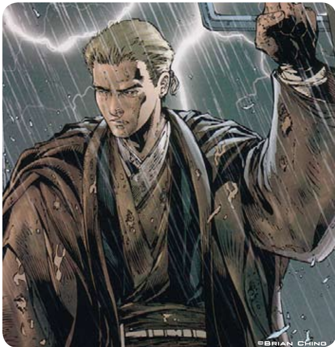
SKYWALKER LEAVES JABIIM

In the second month of the war, Anakin participated in the Battle of Kamino, flying starfighter support to defend the Republic's cloning facilities. Skywalker was forced to abandon his fighter to recover Master Kenobi when his master was shot down. No longer able to assist their fellow Jedi in the aerial battle, Anakin