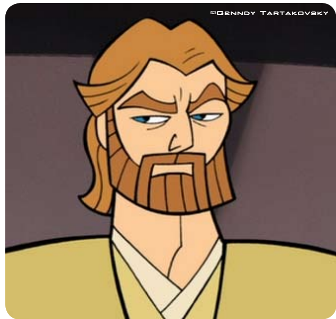
GENERAL KENOBI BRIEFS A UNIT OF ARC TROOPERS

Rendezvousing with the ARC troopers who disabled the Banking Clan's massive artillery cannons, Obi-Wan led the operation to smash the Separatist command center and capture its leaders. The Muuns were easily taken prisoner, but Durge